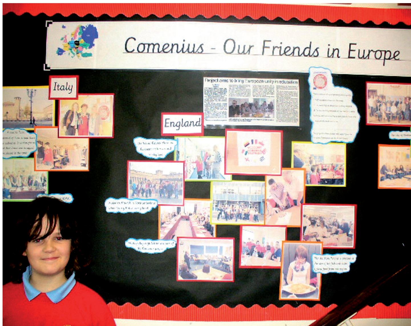
The Great Britain team 1:

“We can all share ideas so that we can make improvements to our school so that everyone is satisfied.”