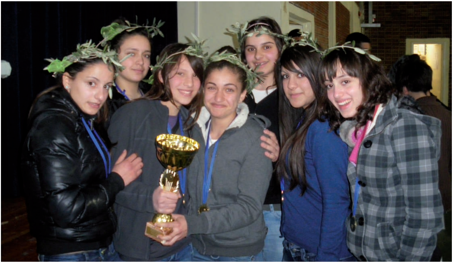
The Cyprus team:

‘Continuous evaluation in schools can lead to success!’